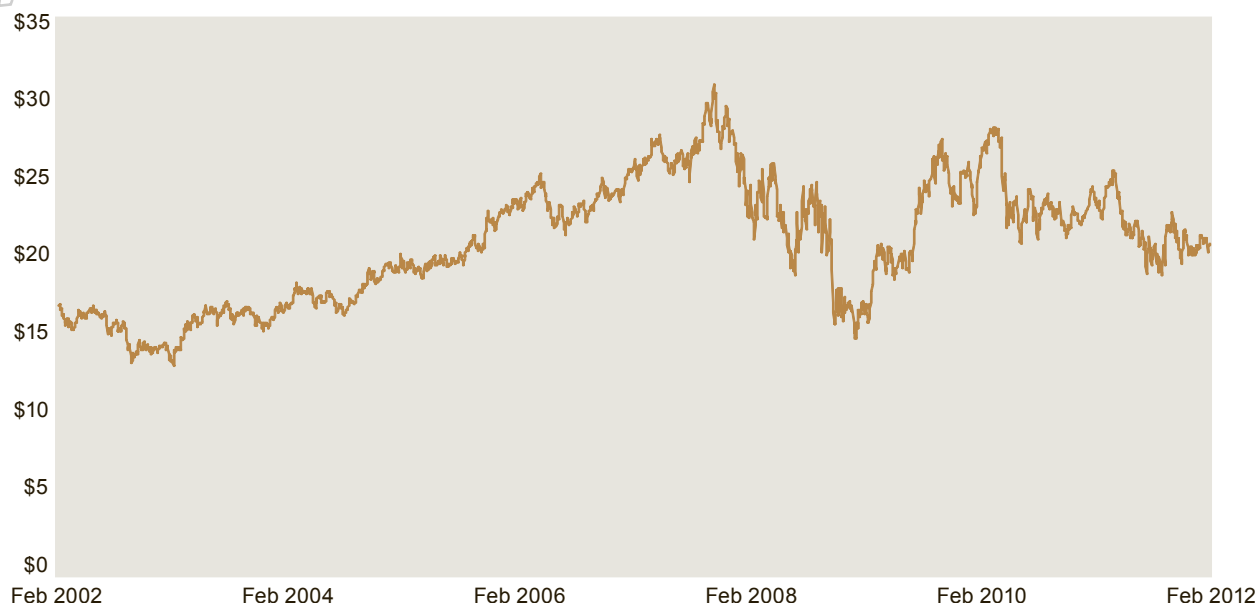
Westpac Ordinary Shares daily closing price 2