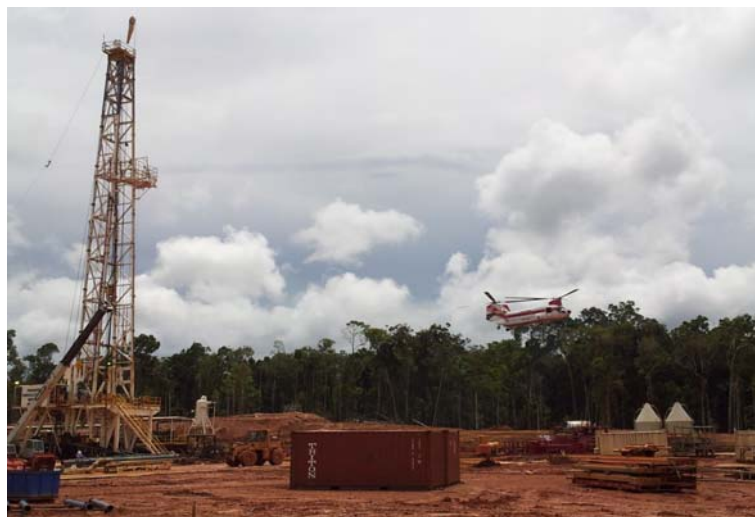
Final mobilization of the rig, prior to spud

The well program is to drill to penetrate the Elevala sandstone and the deeper Toro sandstone down-dip from the Elevala-1 discovery at a location 2.1 km west of that well. The targets will be evaluated to determine the gas water contact, the composition of the hydrocarbon column and the quality of the reservoirs. The planned total depth of the well is 3,500 m to basement. An option to sidetrack to complete the well for production purposes will be available.